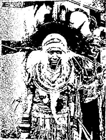
Female student from the Eastern Highlands