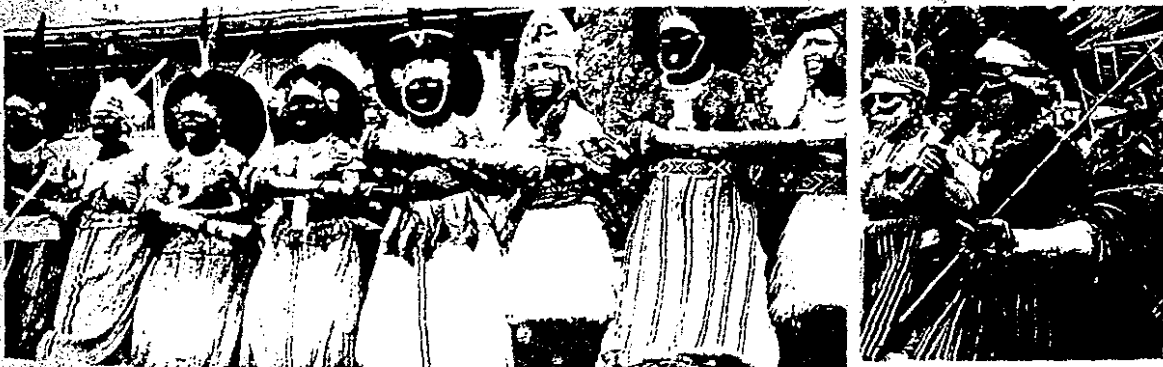
Students from Enga Province